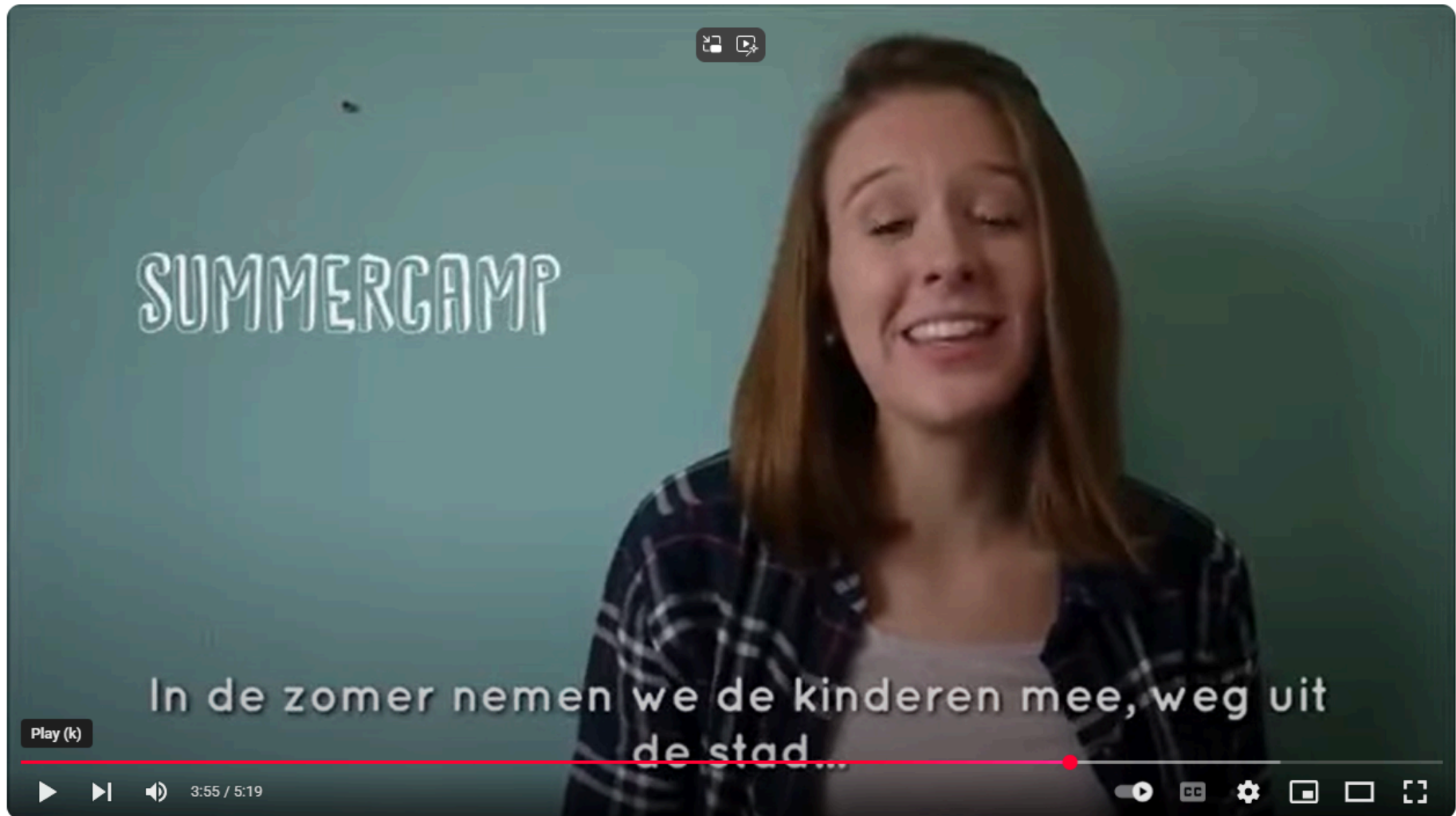
YWAM Constanta: Community Transformation (2015)